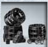
Biological carrier media