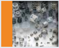
Tower packings for mass and heat transfer