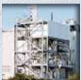
Combustion plants for the disposal of exhaust air, waste gases and liquid media