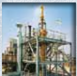
Waste gas scrubbing plants