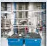
Ammonia recovery processes