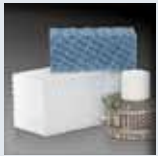
Structured packings for mass and heat transfer